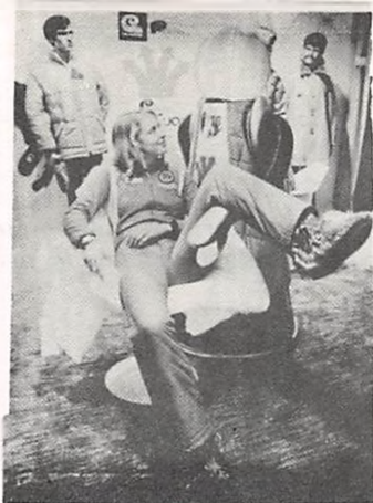
"OTTO" - KING OF THE SLOPES